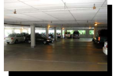
Covered Parking Area