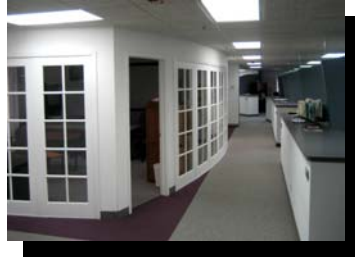
Impressive Interior Finishes