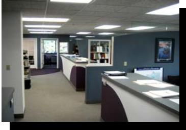
Efficient Floor Plan

CONSTRUCTION: Masonry & Decorative Glass